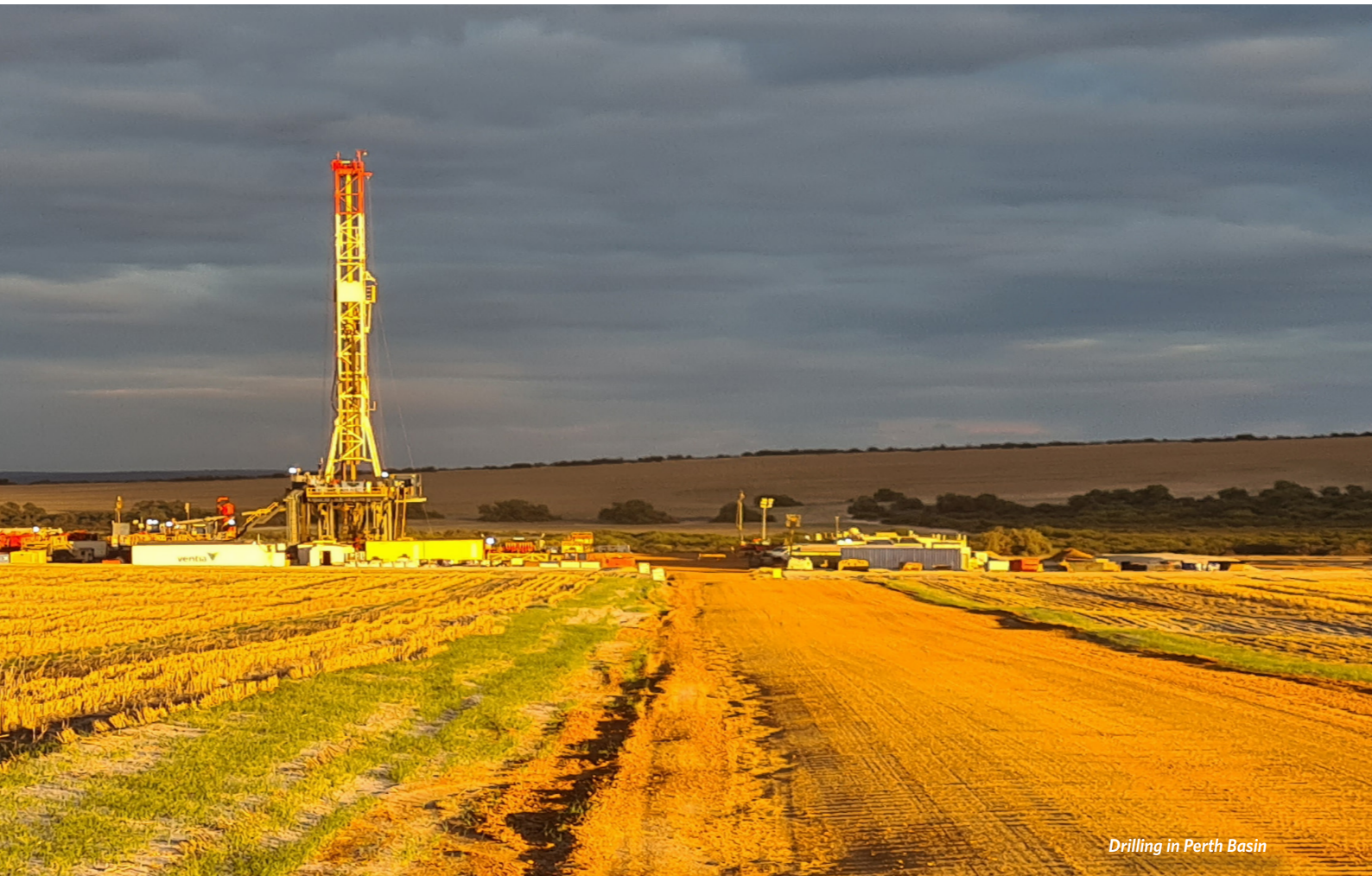
Drilling in Perth Basin