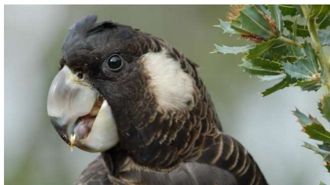
Carnaby's Black Cockatoo.

Beach is committed to producing the energy needed for a sustainable transition – one that supports the needs of societies today, and into the future.