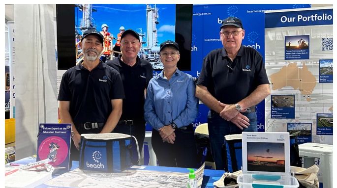
Community team at Mingenew Mid-West Expo

The team interacted with community members to share information on our operations in the Perth Basin as well as answer any questions. Beach was also part of the School Education Trail and students were able to learn more about our operations and how Beach seeks to sustainably deliver energy for the community. Beach would like to thank the community for meeting with us and providing invaluable feedback, so we continue to respond and improve our engagement.