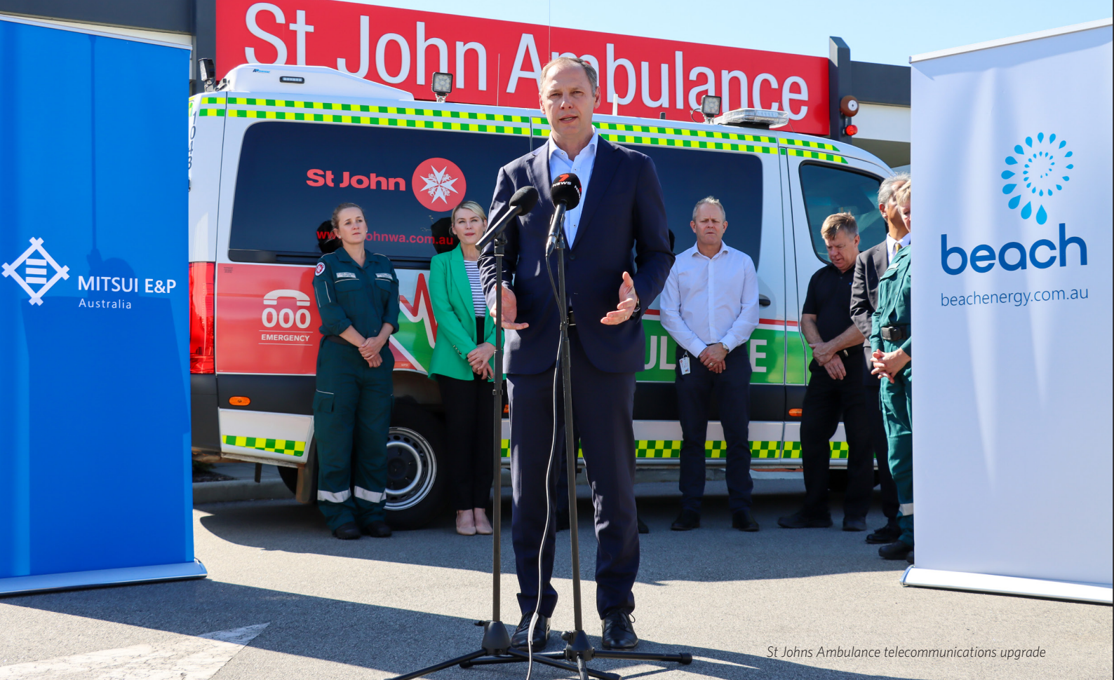
St Johns Ambulance telecommunications upgrade